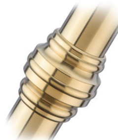
Satin Brass Waxed