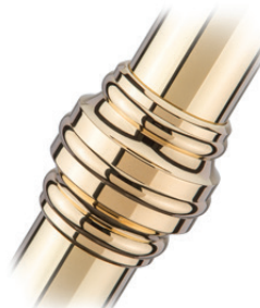
Polished Brass Un-Lacquered