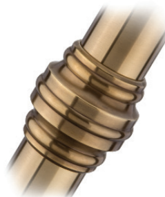
Aged Brass Un-Lacquered