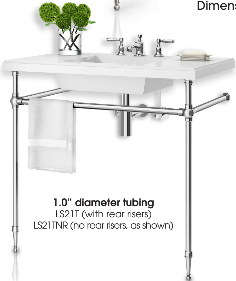
1.0" diameter tubing LS21T (with rear risers) LS21TNR (no rear risers, as shown)