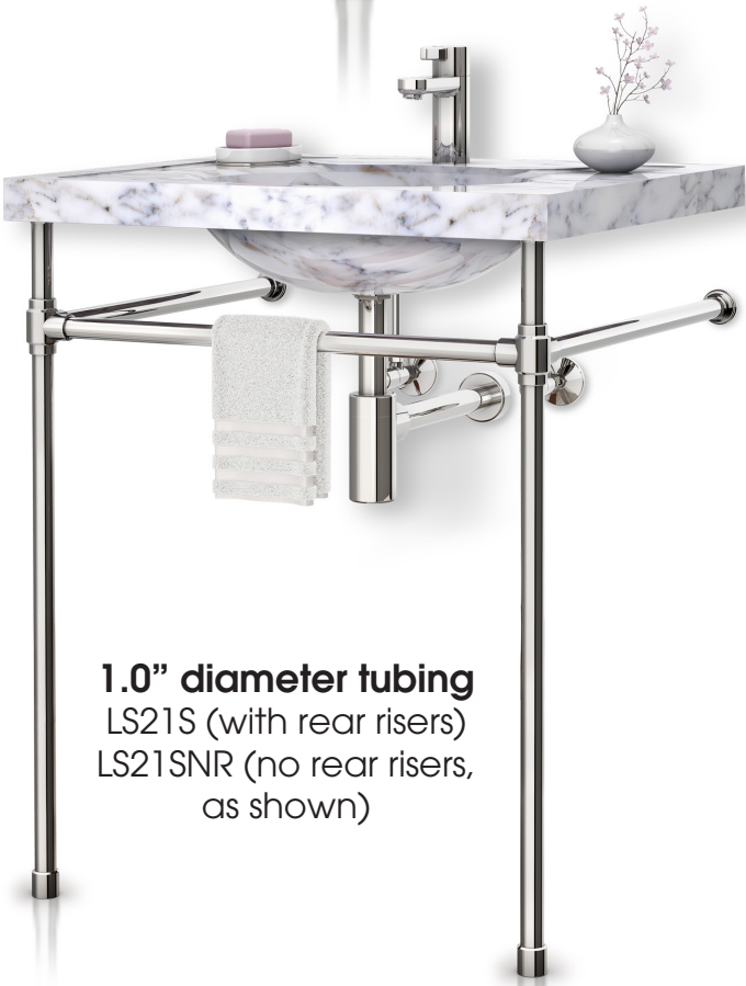
1.0" diameter tubing LS21S (with rear risers) LS21SNR (no rear risers, as shown)