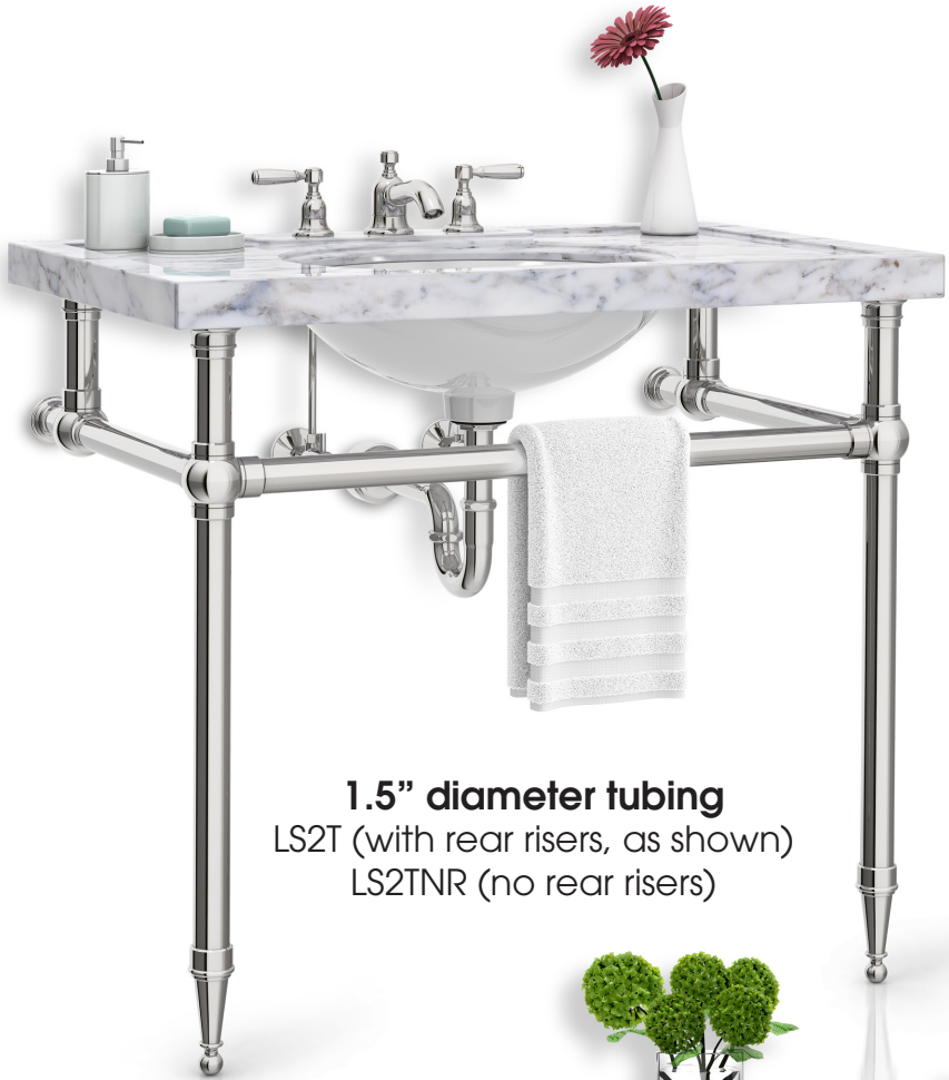
1.5" diameter tubing LS2T (with rear risers, as shown) LS2TNR (no rear risers)

Dimensions: Standard leg size only: 32"w x 22"d x 32"h Leg Systems can be field cut to reduce size