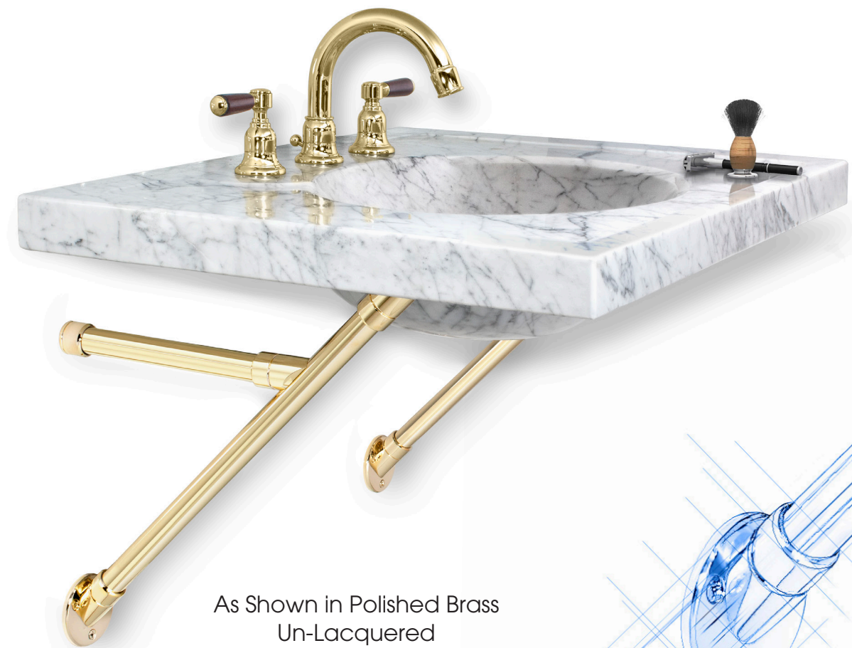
As Shown in Polished Brass Un-Lacquered