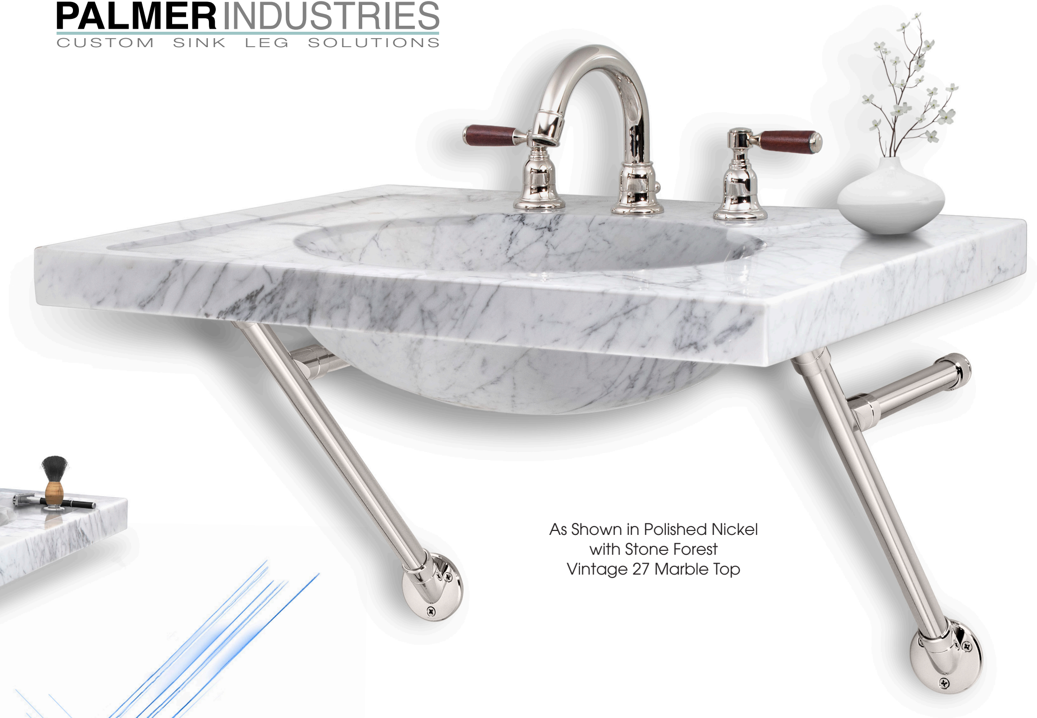
As Shown in Polished Nickel with Stone Forest Vintage 27 Marble Top

WALL MOUNT SYSTEMS REQUIRE SOLID WOOD BLOCKING IN WALL